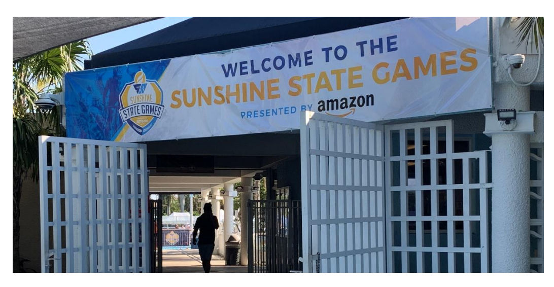
The 2022 Sunshine State Games, presented by Amazon, reached new heights with a presenting sponsor for the first time in nearly 20 years.

The Amazon sponsorship allowed the Florida Sports Foundation to reach more youth and adults to be involved in furthering their commitment to exercise, a healthy lifestyle and the importance of teamwork and competition. It helped ensure the message about the value of being active and engaged reaching more prospective athletes while providing fun and fulfilling opportunities for thousands.